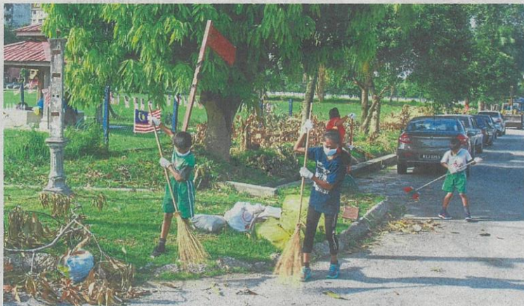
Children taking part in the gotong-royong in Taman Sentosa, Klang.