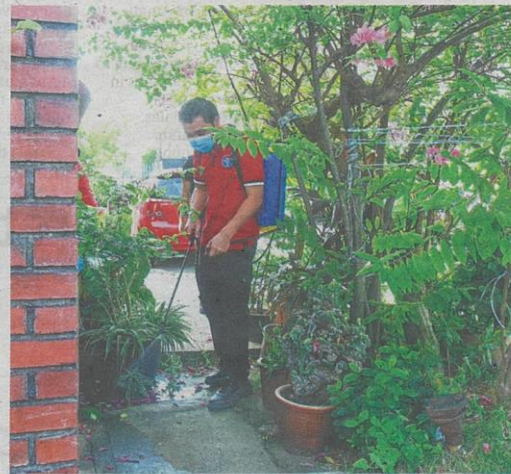
Klang Health Department spraying larvicide around houses in Taman Sentosa.