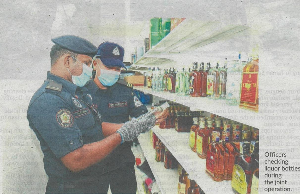
Officers checking liquor bottles during the joint operation.