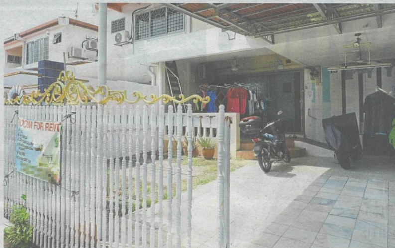
One of the houses in Damansara Utama that is believed to be occupied by multiple tenants.

Damansara Utama residents concerned about risks from houses converted for commercial rental