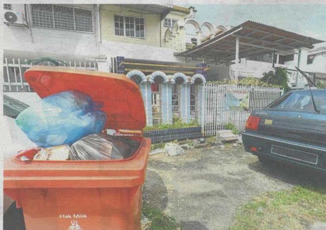
A rubbish bin filled to the brim at one of the houses with multiple tenants.

dow, en suite bathroom and parking within the house compound.